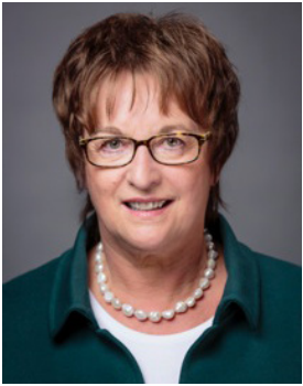
Brigitte Zypries, Parliamentary State Secretary, Federal Ministry for Economic Affairs and Energy